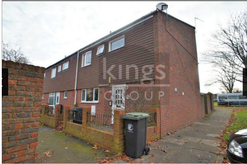
27 MAYNARD CLOSE, WALTHAM ABBEY